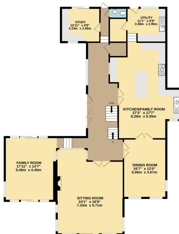
GROUND FLOOR 1883 sq.ft. (174.9 sq.m.) approx.