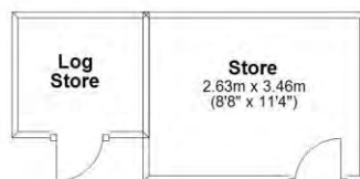
Lower Ground Floor Approx. 73.2 sq. metres (787.8 sq. feet)