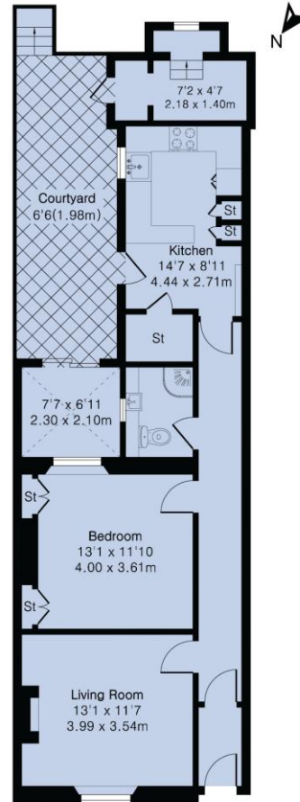
Ground Floor Maisonette

Approximate Gross Internal Area 770 sq ft - 72 sq m